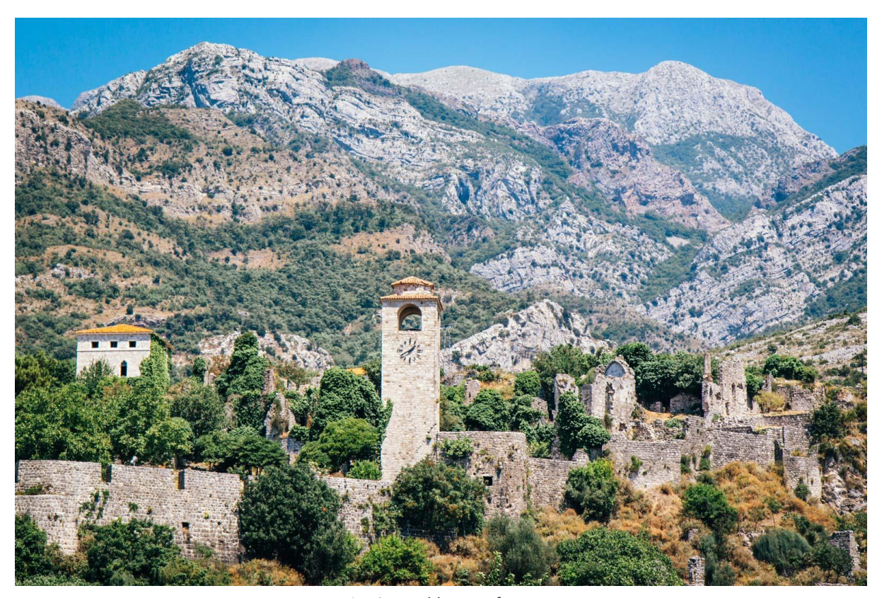
Stari Bar, old town of Bar

The old town of Stari Bar, the first stop on the Hashbus has seen its fair share of troubles. Over the centuries it was taken over by the Venetians, the Serbians, the Hungarians and the Ottoman Empire. The scene of a siege in 1877, it was finally reclaimed by Montenegro from the Turks after the locals bombed the aqueduct into the town and cut off the water supply.