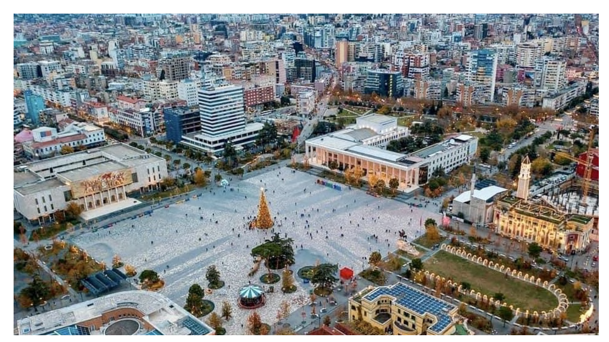
Tirana, Skanderberg square - Lot boutique hotel is out of picture to the right

Sulejman Pasha Bargjini, established the city in 1614. His first constructions were a mosque, a bakery and a hamam (why not a brewery?). Tirana was proclaimed capital in 1925.