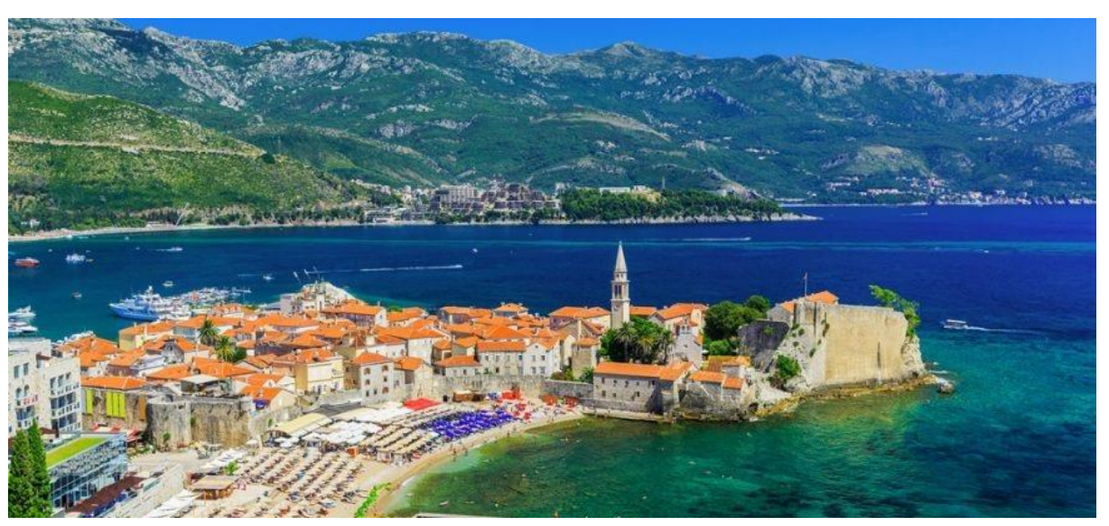
Budva, Astoria Hotel in bottom left corner behind the wall

Budva is a coastal tourist resort in Montenegro. It is often called Montenegrin Miami , because it is the most crowded and most popular tourist resort in Montenegro with beaches and vibrant nightlife. Budva is developed around a small peninsula, on which the old town is situated. There are as many as 35 beaches in the Budva area. So if U have some spare time before the craziness begins U can plunge in the sea and be lazy at one of the beaches. Maybe try to get lost in the old town or walk the city walls or venture away and walk along the boardwalk to Mogren beach or take a quick boat trip to Hawaii (yez, relly).